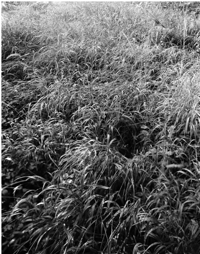
meadow-land (grass#1) Baryt laser-exposed 1.2x1.5m