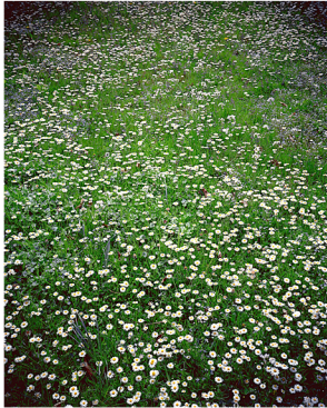
3seasons flowers colorprint laser-exposed 128x165cm