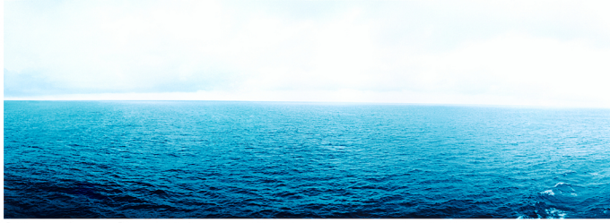
SEA blue (Indian Ocean1997) colorprint metallic laser-exposed 110x300cm